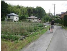
Fig. 25 DISTRICTS – Community gardens