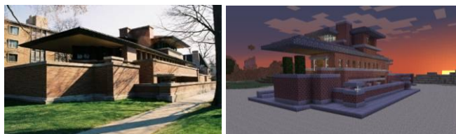
Fig.12. Frank Lloyd Wright's Robie House modeled in two hours.