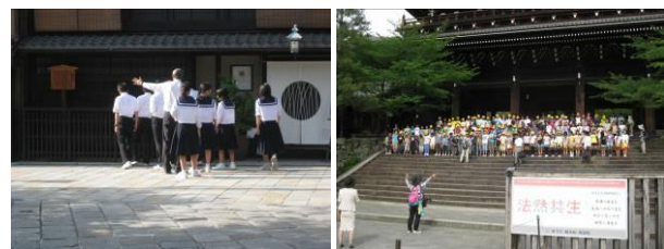
Fig. 23 NODES - Gathering people