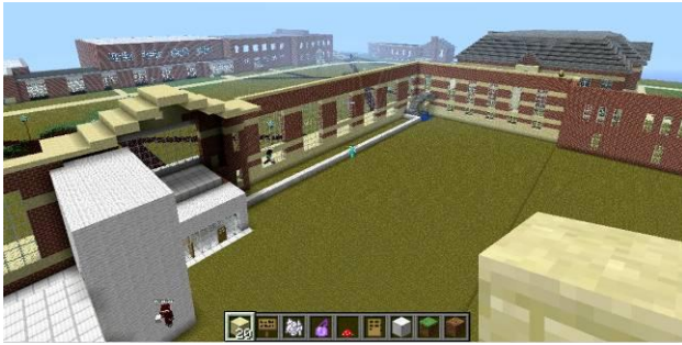
Fig. 16 Group-build of engineering center in two hours

In 2012, the Elizabethtown College Masters Center exterior (with the footprint and a section of facade created in advance), and 50% of interiors were team-built in three hours by 40 students in the College courses: