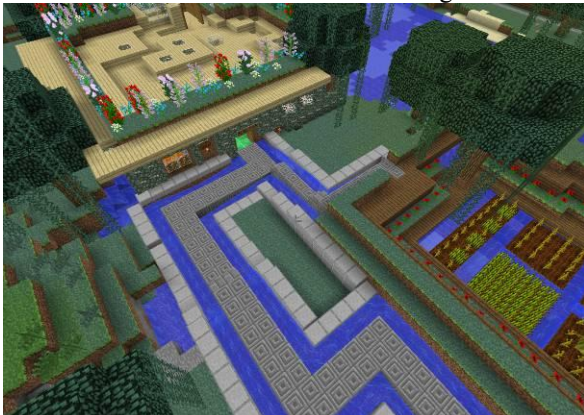
Fig. 27 PATHS - Channel water

Four new town territories (prefectures) were defined for four teams of new Scientific Modeling course students to collectively build Japanese towns and gardens on the new Tsojin Server in 2013, and to individually build a traditional Japanese home. Some results are shown in Fig's 27 to 33.