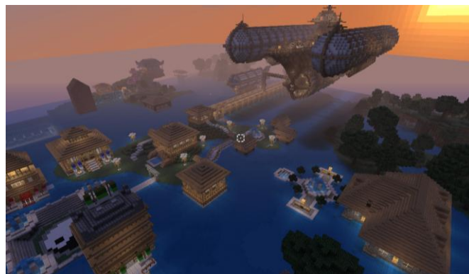
Fig.6 Town-Center of Protected Creative Server “Tsojin”