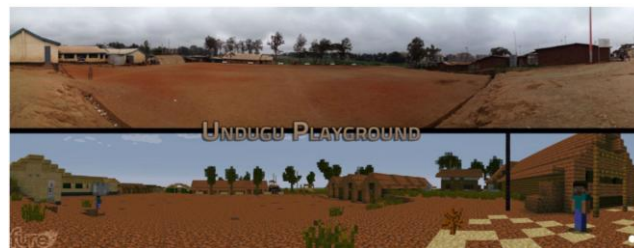
Fig.1 United Nation Modeling of 300 sites.

The United Nations began using Minecraft in 2012 for sustainable design of 300 sites worldwide; The U.N., architects and planners use this multi-user, social-networking tool to allow the inhabitants of each site to become part of the design process [3]. Although this work began well after our initial work, this international UN initiative provides validation of the use of this game as an educational tool.