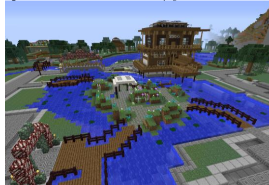
Fig. 33 DISTRICTS – Tranquil retreats