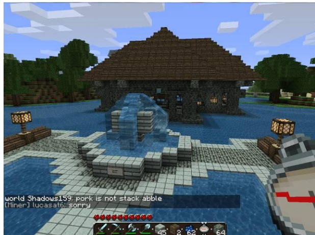
Fig. 4 Building on Public Servers

In 2012 Joseph John Wunderlich spent many hours building significant architectures on public servers around the world. These builds, with some help from a few apprentices, led to significant on-line collaboration that would later lead to development of new servers. Unfortunately, on these public servers, architecture is often destroyed by vandals; termed “greifiers.” Consequentially, Joseph and a few of his comrades would build complex underground structures with only a small house on the surface as shown in Fig. 4. Or build fortresses in remote locations.