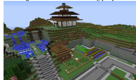
Fig. 32 DISTRICTS – Community garden and livestock