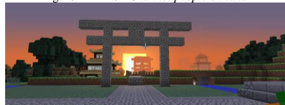
Fig. 30 PATHS – Gateways