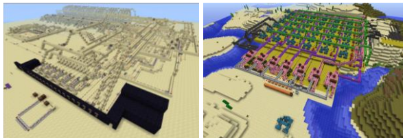
Fig. 10 Digital Circuits: Combination lock and Random number generator

In addition to teaching Architecture and Environmental Design, the lead author teaches many Computer Engineering and Computer Science courses where students have used combinational and sequential digital-circuit building techniques in Minecraft to create logic gates, memory devices (Flip-flops), digital clocks, a tic-tac-toe game, and the combinational lock and random number generator shown in Fig.10. These electrical elements have also been combined with mechanical elements (pistons, etc) in many of the worlds to create moving doors and other machinery.