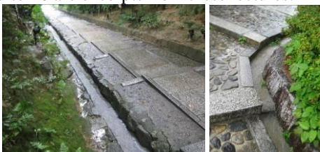
Fig. 17 PATHS - Channel water

After the authors presented some of their initial work in a key-note talk in Japan in 2013 [2], and then extended the trip two weeks to study Japanese architecture (mostly in Kyoto), the lead author created lectures on Japanese architecture and environmental design for new students preparing to create Japanese towns on a new Wunderlich server in Fall 2013. Figures 17 to 26 are excerpts from these lectures: