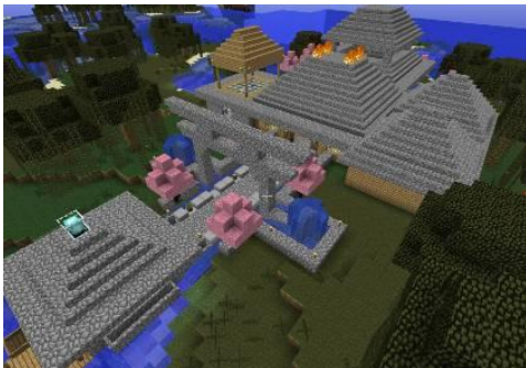
Fig 34 Wellness Center in a Japanese Town

In 2013, visiting high school students again competed in building in two hours, Wellness Centers; but unlike in 2012 in "Sustainable Towns" where everyone built a pool, activity room, and locker rooms, this contest required wellness centers in Japanese Towns to contain a meditation room, tranquility pool, and Japanese garden. One design is shown in Fig. 34.