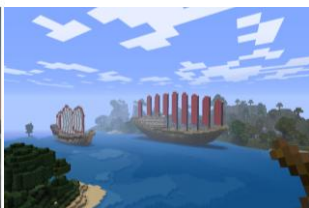
Fig. 3 Draft Tsojin world