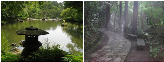
Fig. 26 DISTRICTS – Tranquil retreats

After the authors returned from Japan in 2013, the new Tsojin Server was launched using the original Tsojin town shown in Fig. 6 as the “Spawn-Point” for the new server. The town was contained in a specially-protected envelope so that nobody could build in it; and only use it for inspiration and to read posted directives; Also, four new town territories were defined for four teams of new Scientific Modeling course students to build Japanese towns and gardens.