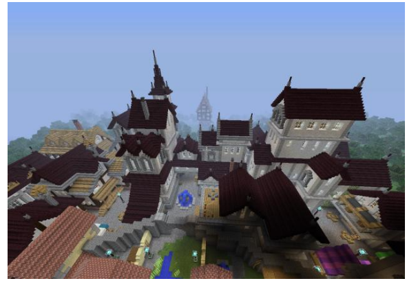
Fig. 36 European Architecture World