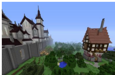
Fig. 35 European Architecture World