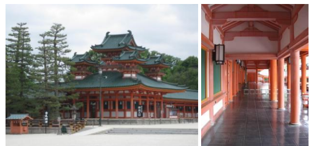
Fig. 22 NODES - Gathering people