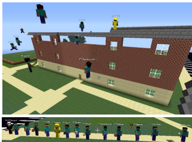
Fig. 15. Group-build of two dormitories in two hours

In 2012, the Elizabethtown College Hackman Apartments were team-built in only two hours by 16 students in College courses: