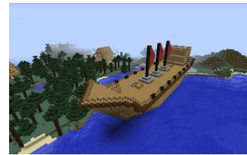
Fig. 28 PATHS - Channel people on water