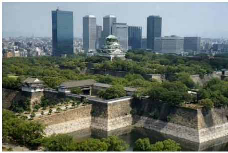
Fig. 24 DISTRICTS – Gathering people