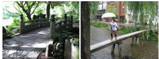
Fig. 20 PATHS - Channel people on land