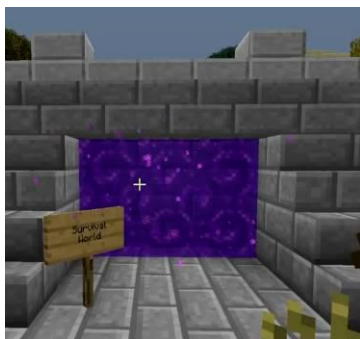
Fig. 11 Portal to another world.

The authors combined the following worlds onto a Multi-world server: