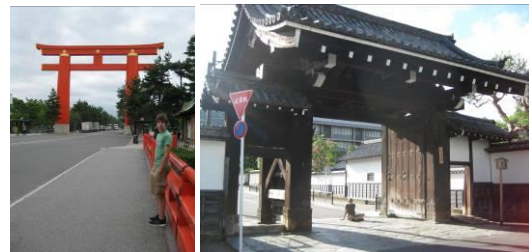
Fig. 21 PATHS and EDGES - Gateways