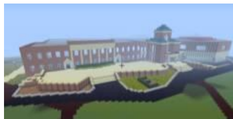
Fig. 14. One of many College campus buildings Most of the entire Elizabethtown College campus was modeled in Minecraft by one very talented student.