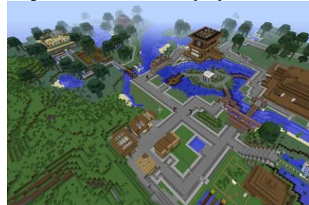
Fig. 29 PATHS - Channel people on land