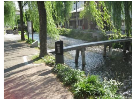
Fig. 18 PATHS - Channel water