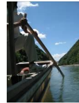
Fig. 19 PATHS - Channel people on water